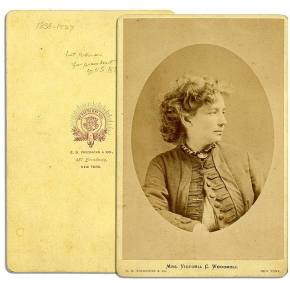
Cabinet card portrait of Victoria Woodhull, 1870.