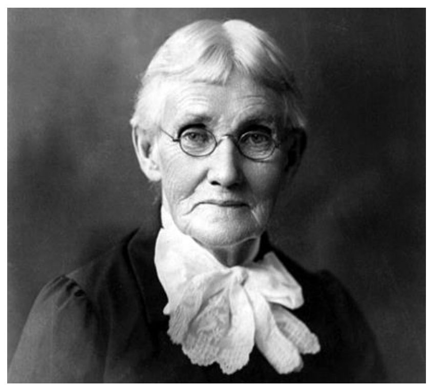
Photograph of Mary Ann Bickerdyke, 1898.