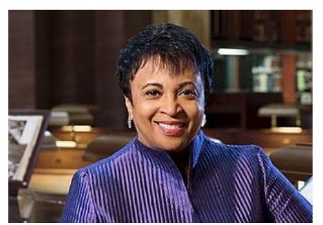
Carla Hayden in the Library of Congress Main Reading Room, 2020.