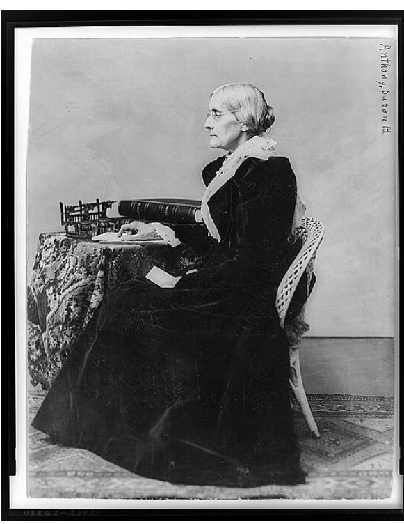
Portrait of Susan B. Anthony, between 1880 and 1906.