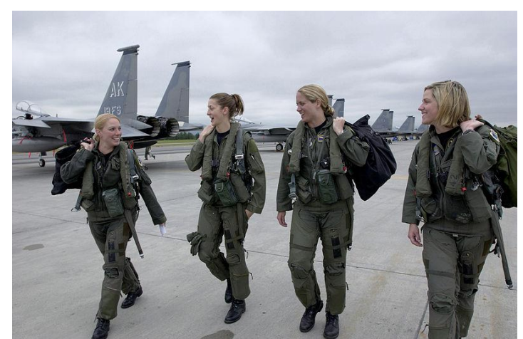
Four F-15 Eagle pilots at Elmendorf Air Force Base, Alaska, 2006. U.S. Air Force, Public Domain. http://www.af.mil/weekinphotos/wipgallery.asp?week=175

https://ncwhs.org/votes-for-women-trail/