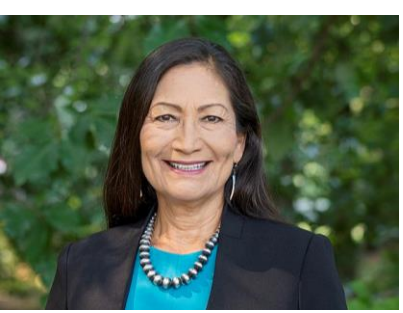
Official headshot of Deb Haaland, 2021.