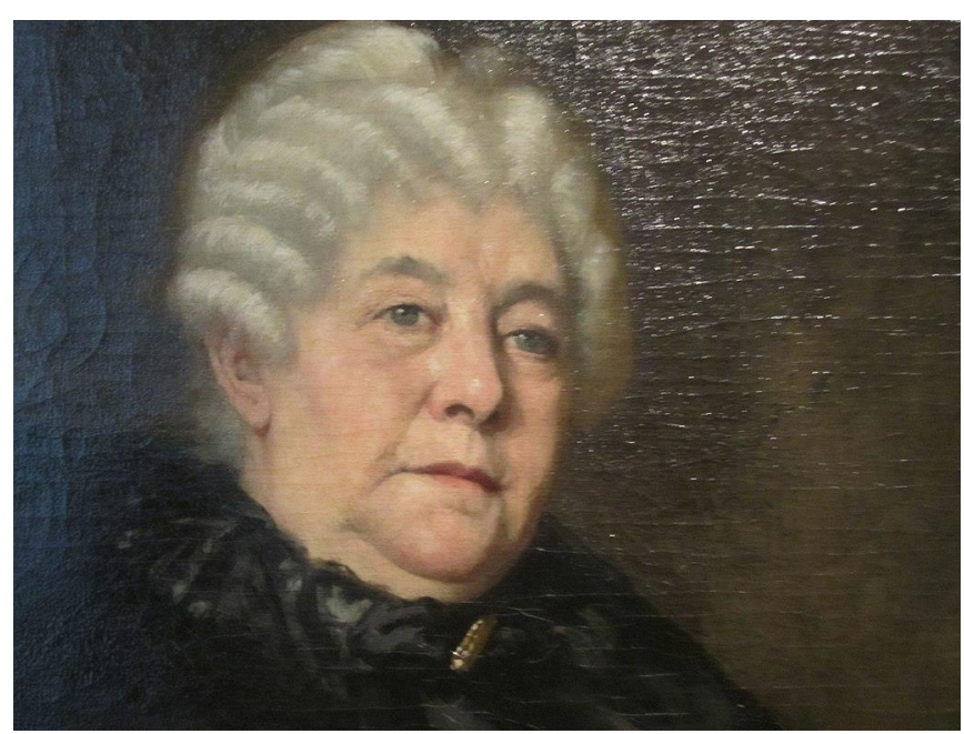
Partial portrait of Elizabeth Cady Stanton, 1889.